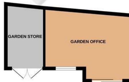
TOTAL FLOOR AREA : 1352 sq.ft. (125.6 sq.m.) approx.

Whilst every attempt has been made to ensure the accuracy of the floorplan contained here, measurements of doors, windows, rooms and any other items are approximate and no responsibility is taken for any error, omission or mis-statement. This plan is for illustrative purposes only and should be used as such by any prospective purchaser. The services, systems and appliances shown have not been tested and no guarantee as to their operability or efficiency can be given.