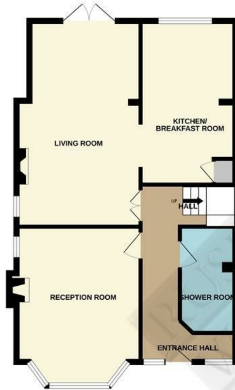
GROUND FLOOR 686 sq.ft. (63.7 sq.m.) approx.